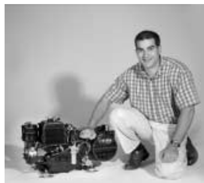
3.5 kw shown